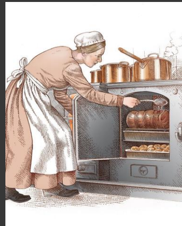
Making Butter. The Stove/aga used in Victorian kitchens