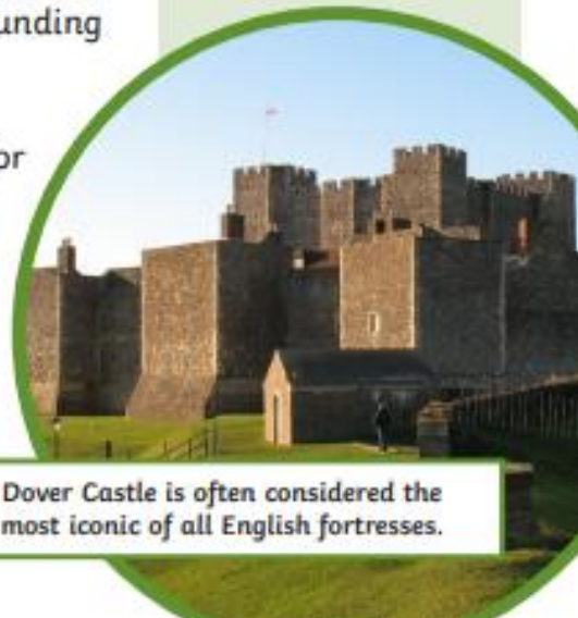
Dover Castle is often considered the most iconic of all English fortresses.